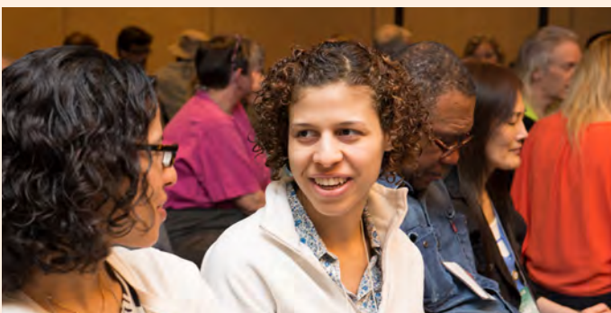
Meet people from around the world who share how the teachings of ECK help them in their lives.