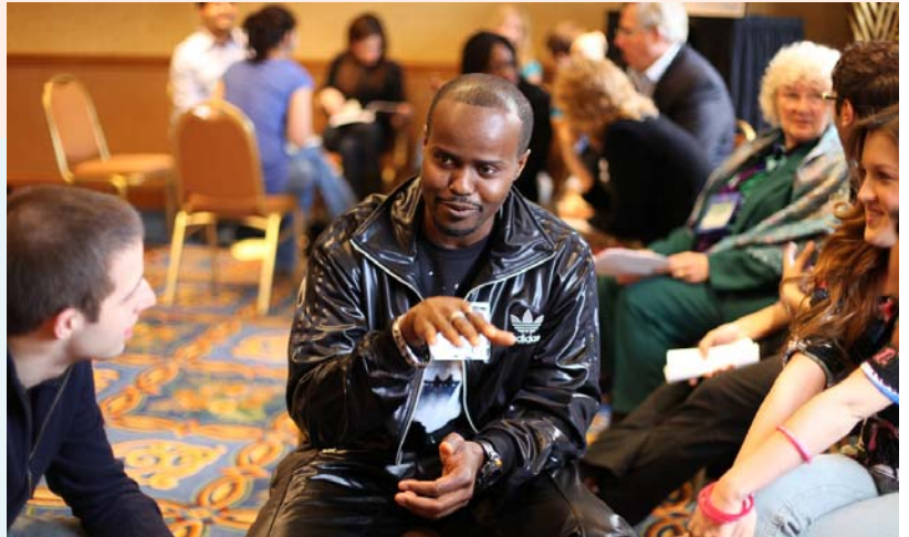
Meet people from all over the world who share how they found their own doorway to heaven.