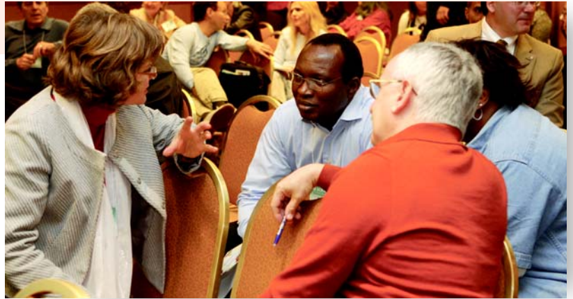
Meet people from all over the world who share what they’ve learned on their own spiritual adventures in the Light and Sound of God.

To view a video, “The ECK Seminar Experience,” go to www.ECKseminars.org .